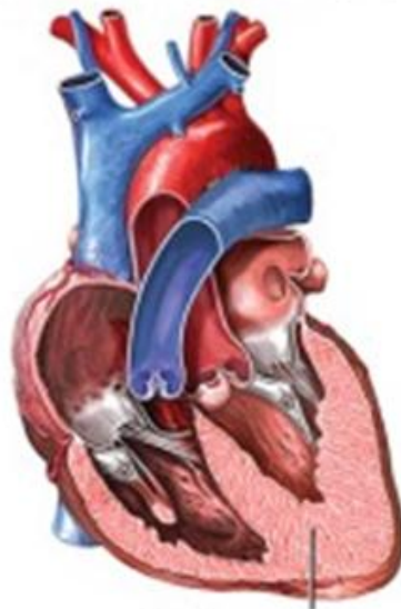
Enlargement of heart muscle